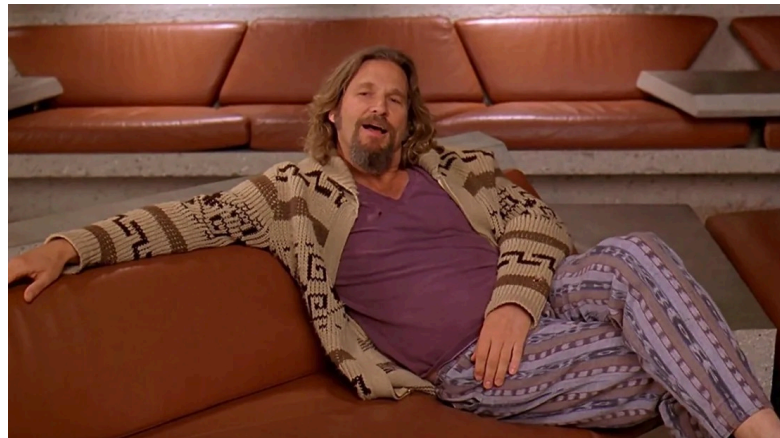
The Dude is ready to operate in his slippers